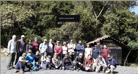
Santuario de Fauna y Flora Iguaque Boyacá-Colombia

Workshop 4 in Colombia (December 2023) Summary here →